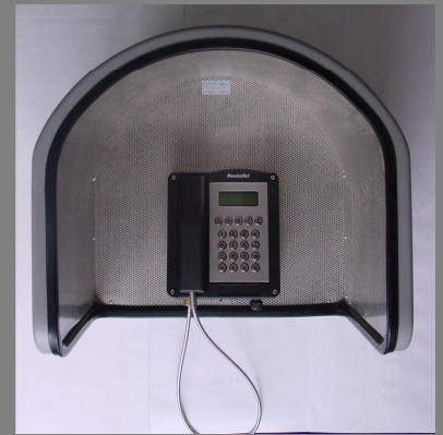
Phone Hood with Resistel Outdoor Telephone Set